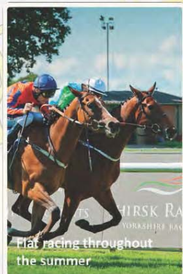
Flat racing throughout the summer