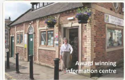
Award winning information centre

© OpenStreetMap Contributors, Thirsk Tourist Information and associates