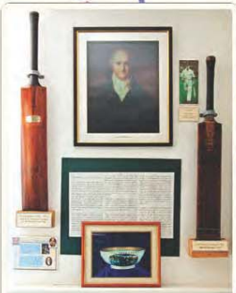
Thirsk Museum, birthplace of Thomas Lord