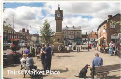
Thirsk Market Place