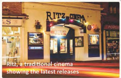
Ritz, a traditional cinema showing the latest releases