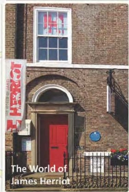
The World of James Herriot