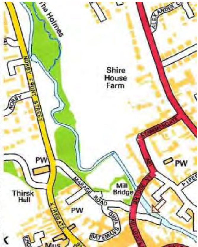
Map of current street plan as it is today for comparison

Bear left along this path which is now running parallel to the Cod Beck on your right and cross some muddy ground over a small wooden footbridge. Keep on this path till it reaches another longer, narrow metal footbridge over the Cod Beck at