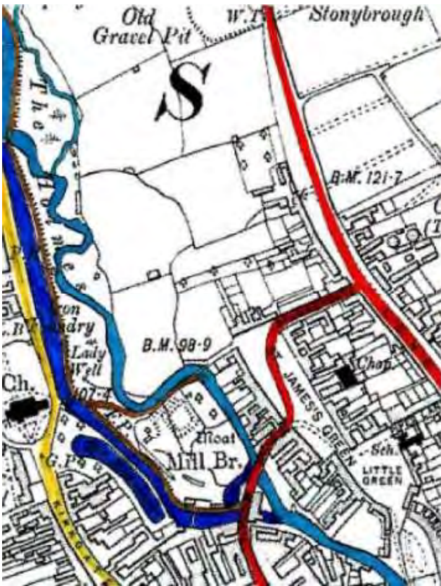
Reproduction of original Old Map showing original features

for a short distance till a sloping path goes down sharply left to the only kissing gate on this walk.